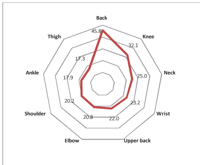
Figure 1. Evaluation of body pain and discomfort by Nordic questionnaire