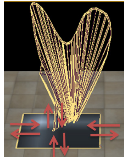
Figur 2) Force Plate Agility procedures. Force Plate – going clockwise on dominant foot

Participants at the center of the force plates, and Then subjects on their dominant leg to maintain balance, participants jump from center forward and back to the center, then to the right and back to the center, then backward and back to the center, and finally to the left and back to the center.