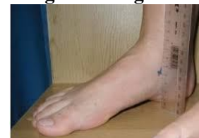
Figure 1. Navicular bone collapse measurement.

Afterwards to measure Staheli index, the testees were asked to cover their feet with Talc powder and to stand with no sliding in their feet on the inflexible surface and then to pick up their feet off the inflexible surface. Finally, according to the foot arch index calculation method based on Staheli process (Figure 2), firstly, the distance between the narrowest section