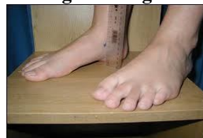
No weight bearing state