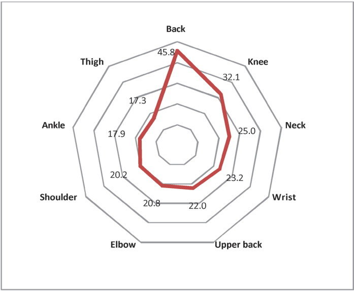
Figure 1. Evaluation of body pain and discomfort by Nordic questionnaire