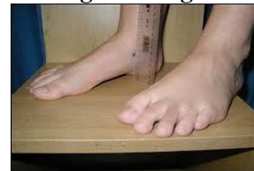
No weight bearing state