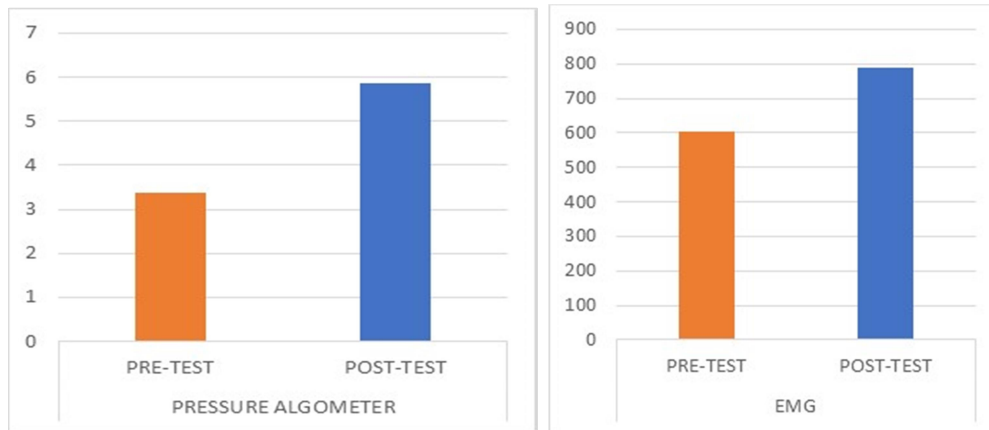
Fig-2) Pre and post-test of the control group