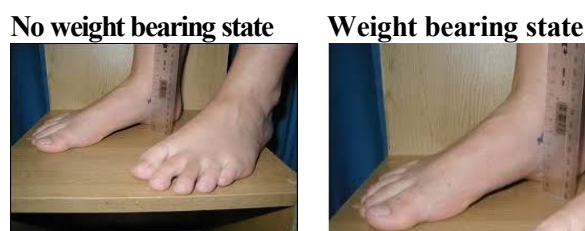
Figure 1. Navicular bone collapse measurement.

Afterwards to measure Staheli index, the testees were asked to cover their feet with Talc powder and to stand with no sliding in their feet on the inflexible surface and then to pick up their feet off the inflexible surface. Finally, according to the foot arch index calculation method based on Staheli process (Figure 2), firstly, the distance between the narrowest section