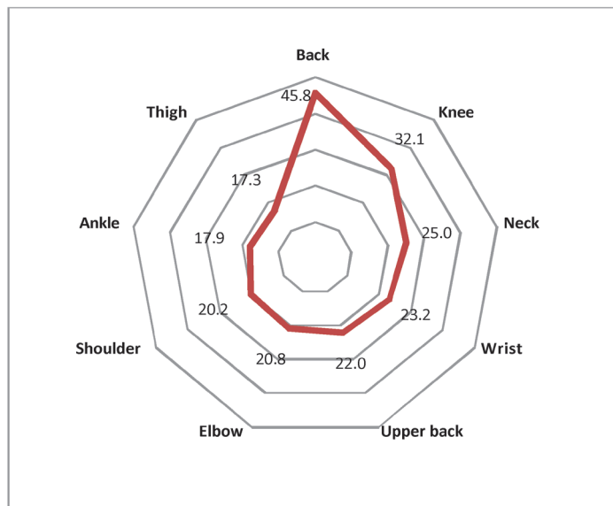
Figure 1. Evaluation of body pain and discomfort by Nordic questionnaire