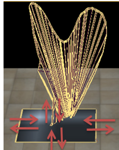
Figur 2) Force Plate Agility procedures. Force Plate – going clockwise on dominant foot

Participants at the center of the force plates, and Then subjects on their dominant leg to maintain balance, participants jump from center forward and back to the center, then to the right and back to the center, then backward and back to the center, and finally to the left and back to the center.